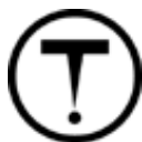
D2A - Very Toxic