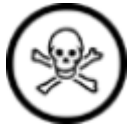
D1A - Very Toxic