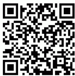
Scan QR code to see our How-to-Foam Video

Refer to the Material Safety Data Sheet before using this product.