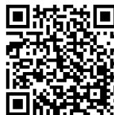
TC-274 Part A SDS