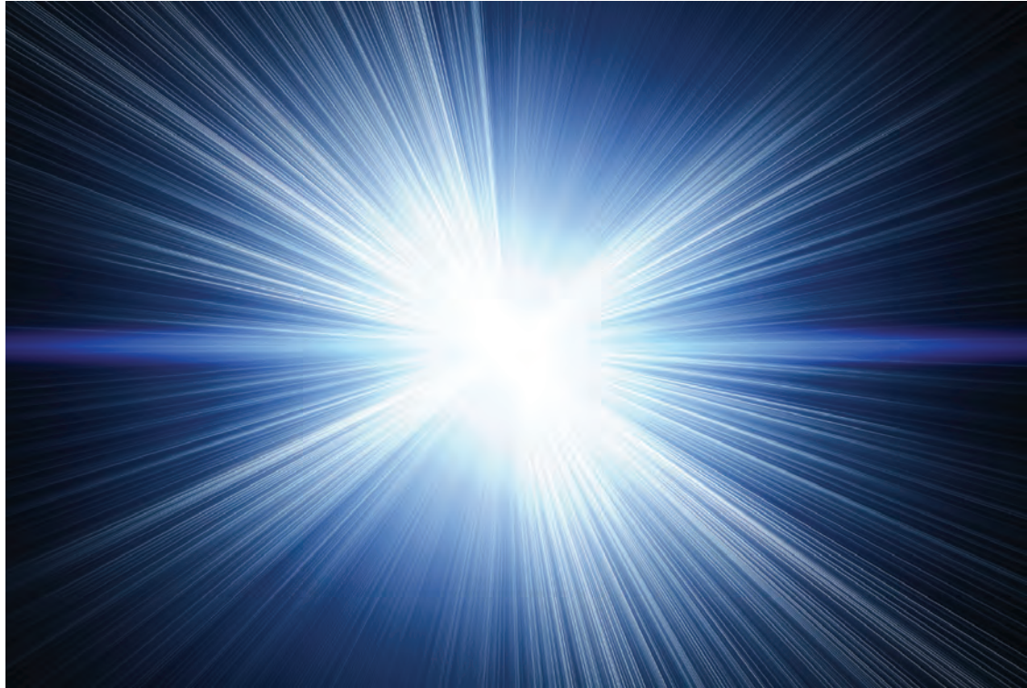
Typical property values should not be used as specifications